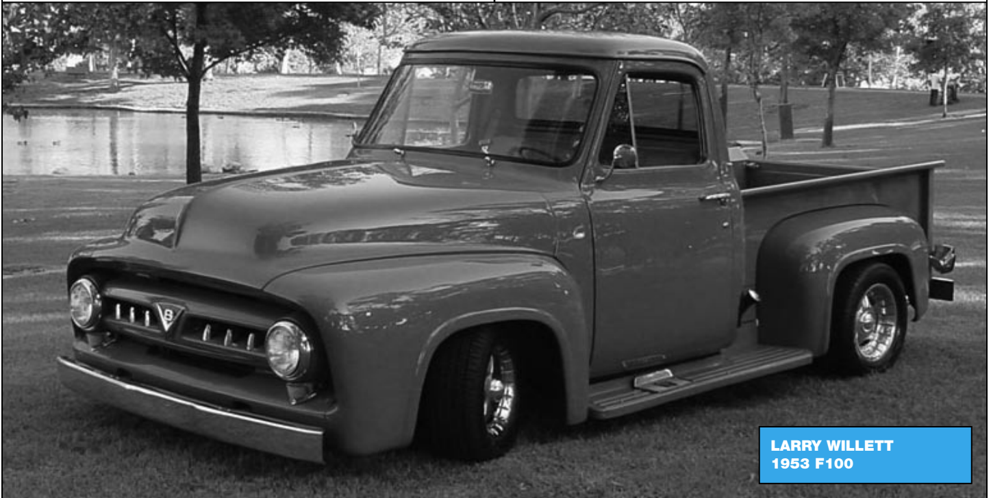
LARRY WILLETT 1953 F100

"VISIT OUR WEBSITE FOR DETAILED PICTURES OF PRODUCT AS WELL AS ADDITIONAL PARTS, ACCESSORIES, AND UPDATES"