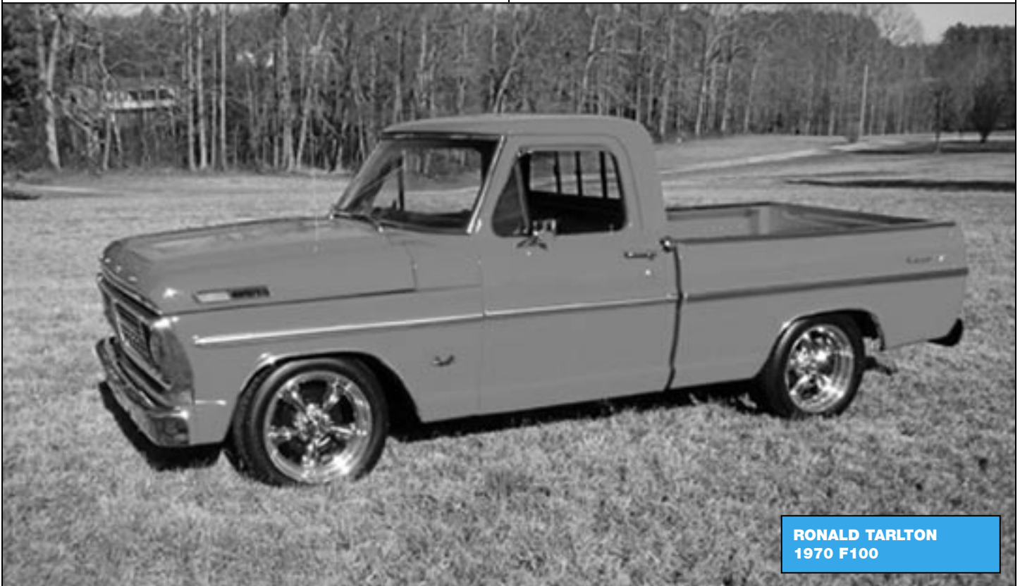
RONALD TARLTON 1970 F100

B= 1/8" Molded Industrial Polyvinyl (MIP) is resistant to moisture, temperature, and chemicals. This material will not dry, rot, or crack and is very durable and easy to clean. Mip Mats are vacuum molded from the original floor plan to cover the entire cab floor making installation simple. The MIP floor mat includes 36 ounce jute padding to provide a higher level of insulation against heat, cold, and road noise. Requires minimum shipping of $20.00