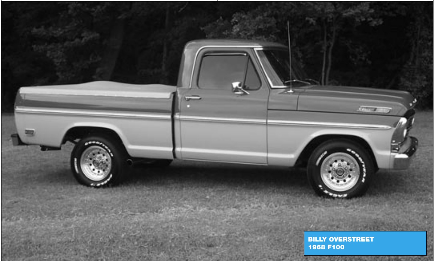
BILLY OVERSTREET 1968 F100

B= also available in Shadow Blue, Presidio Grey, Napa Red, and Lt. Buckskin