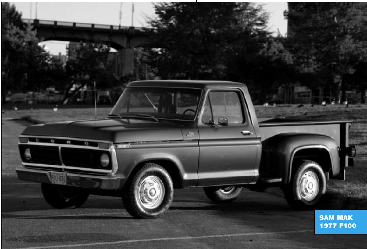
SAM MAK 1977 F100

E= also available in Blue, Gray, Napa Red, and Saddle