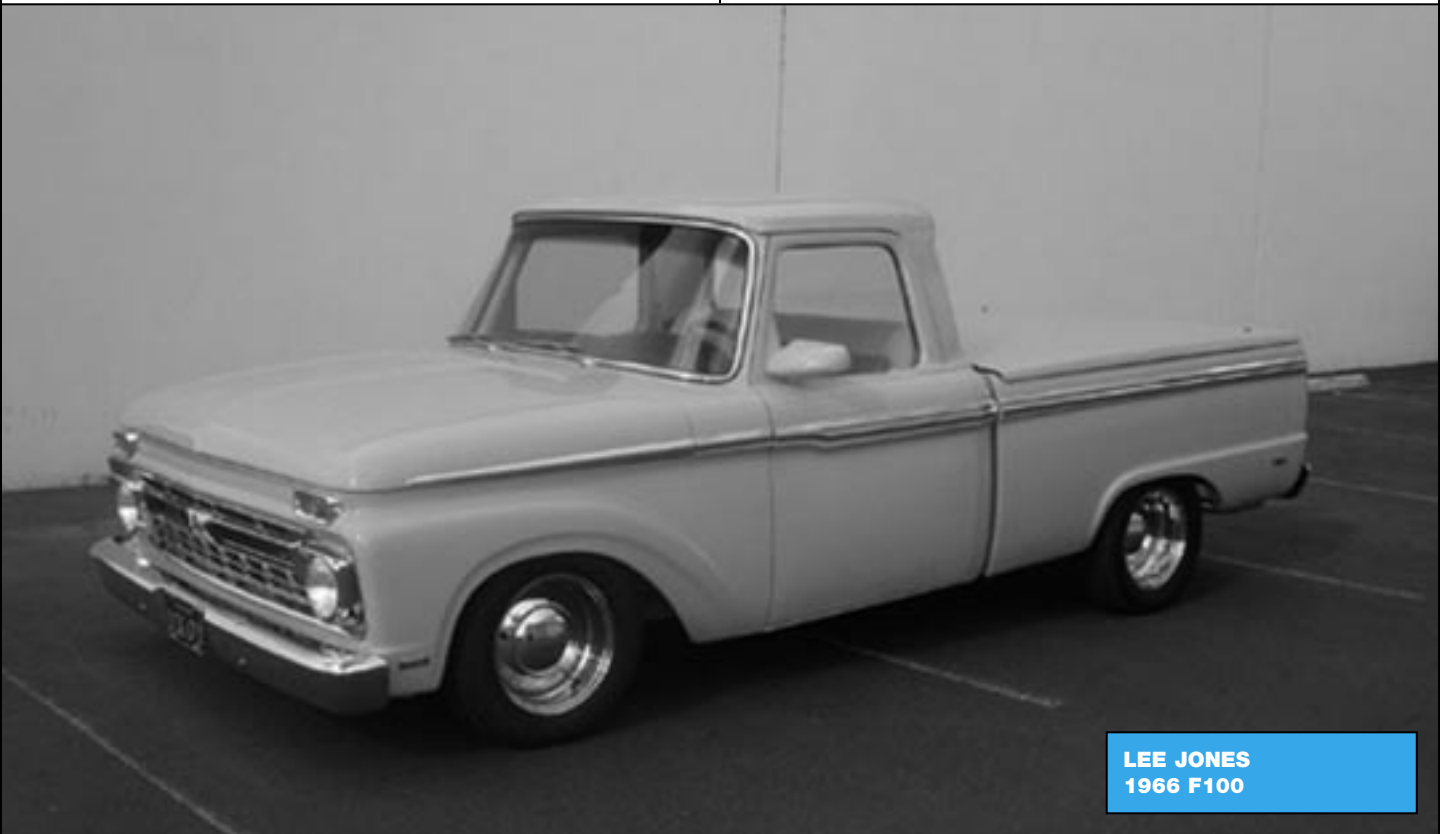
LEE JONES 1966 F100

A= ABS Insulated - Molded and pre-cut holes for easy installation to fit your original truck firewall. This item is oversized. Requires minimum shipping charge of $15.00. Firewall Covers with no holes can be special ordered. Please call for information.